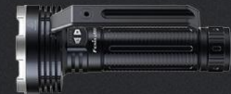
Fenix LR80R flashlight (built-in battery pack)